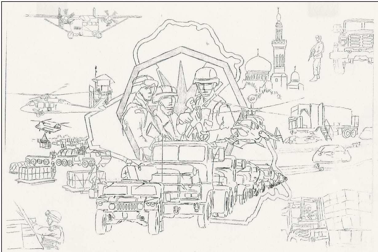
Black and White Artist Concept Sketch Actual size 18' x 24" in full-color